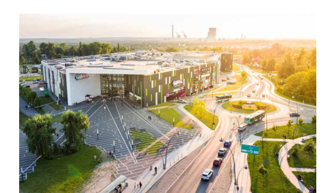
Galeria Galena, Jaworzno, Poland

PA NOVA's comprehensive evaluation process considered other major competitors alongside Polish UHY member firm UHY ECA Group. The business chose UHY ECA Group because