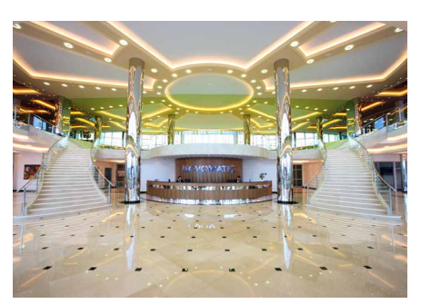
Novomatic headquarters, Gumpoldskirchen, Austria

Argentina's volatile economic situation means local businesses face exchange rate and tax changes, fluctuating market regulations and inflation. The pandemic has left a third of the country's workforce unemployed and a significant economic contraction reported for 2020. It has been UHY Macho's challenge to steer its client through these uncertain times.